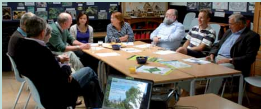
Training session for volunteers assisting with profile raising

– Our members' newsletter goes from strength to strength, winning the award for Best Newsletter at the Civic Voice AGM. We continue to receive compliments for the breadth