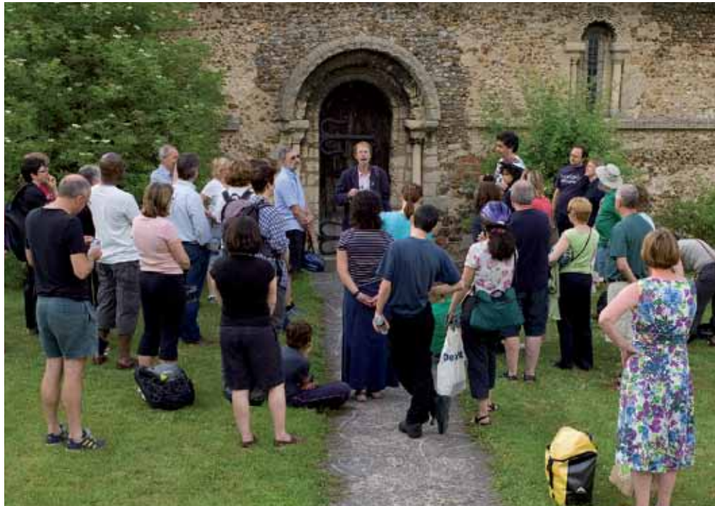
The Leper Chapel

Interest in The Leper Chapel and the programme of events continues to grow. There was a season of theatre performances, Twelfth Night adapted and devised for performance at the Chapel, Macbeth in the summer and M. R. James Ghost Stories in December.