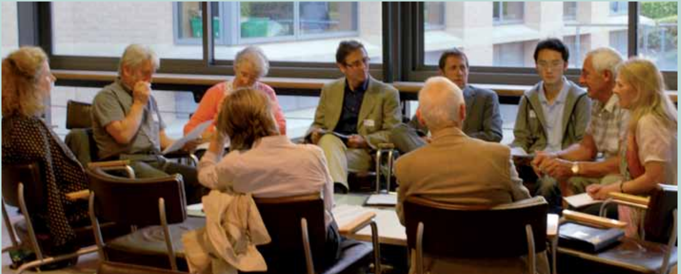
2030 Vision workshop

We are discussing with the City Council projects on localism and planning, and on revitalising the City centre and plight of local community pubs. To encourage debate and best practice we have organised a number of events during the year in partnership with the University, FeCRA, the City Council and the RSA. These included workshops on conservation areas and planning for our futures. Additionally with a wide range of partners we have started a new series of at least ten workshops on the '2030 Vision' – What kind of place do we wish the Cambridge sub-region to be in twenty years time? The first workshop on